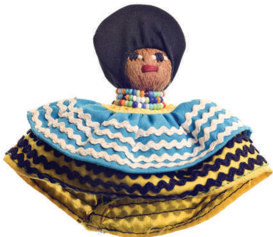
Today, Seminole people continue a tradition of doll making.

The nations of the Southeast made items that were both useful and beautiful. For example, many peoples of the Creek Confederacy crafted metal jewelry and stone tools. Southeast peoples also wove cloth for blankets and plant materials for baskets. The tradition of basket weaving by the Cherokee and Choctaw peoples, passed down through generations, continues to this day.