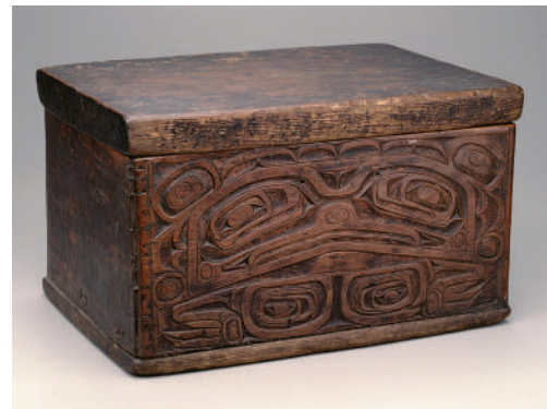
This carved box shows the woodworking skill of the Tlingit people of the Pacific Northwest.

A major form of art that continues to be important for the peoples of the Pacific Northwest is woodworking. The forest provides a generous supply of wood that can be carved into fine art. Artisans craft many items,