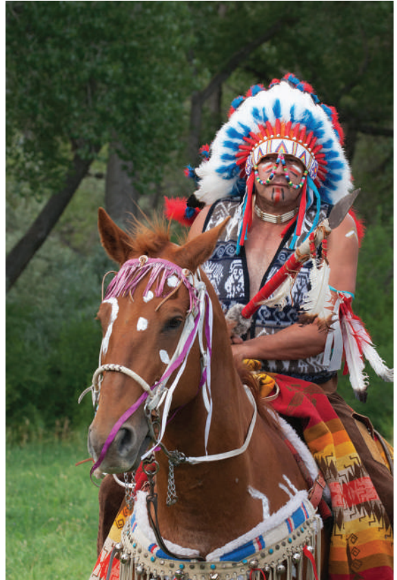
The war bonnet symbolizes a person's bravery and good deeds.

Many Plains nations created art on rocks. They carved or painted scenes that told stories of important battles, successful hunts, or other memorable events. For many nations, the four directions (north, south, east, and west) were sacred , and each was associated with a specific color. The medicine wheel was an object or