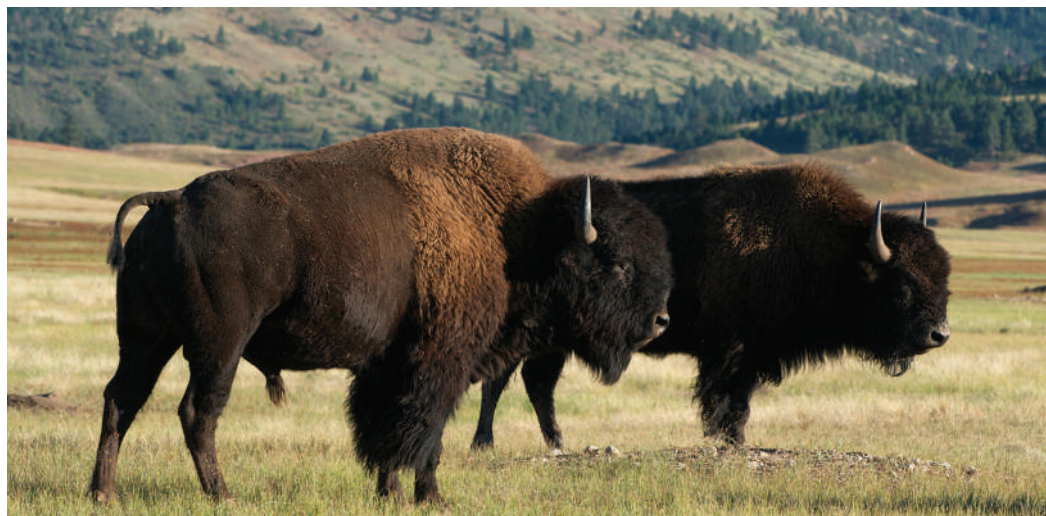
Plains peoples hunted bison for food and clothing.

awl , n. a sharp, pointed tool used for sewing and making holes