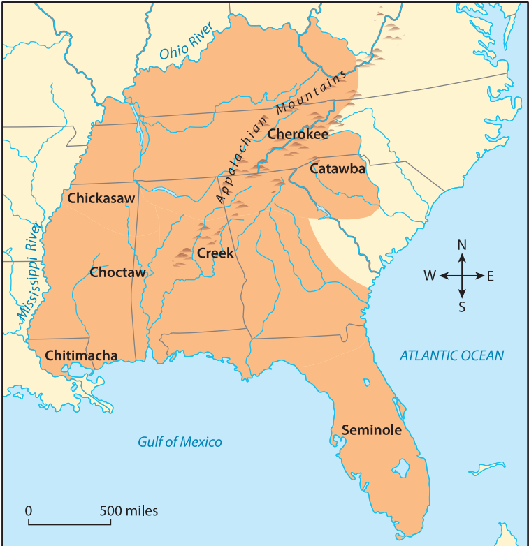
The nations of the Southeast were located east of the Mississippi River, from the Ohio River south to the Gulf of Mexico.