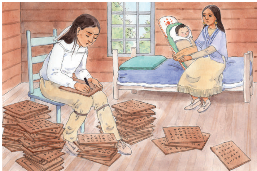
Sequoyah created the Cherokee syllabary, a set of written characters representing syllables.

The peoples of the Southeast spoke several languages. Some of these languages were similar enough that people from one group could speak with those in another. Many people in the region were skilled at learning the different languages, which made communication easier.