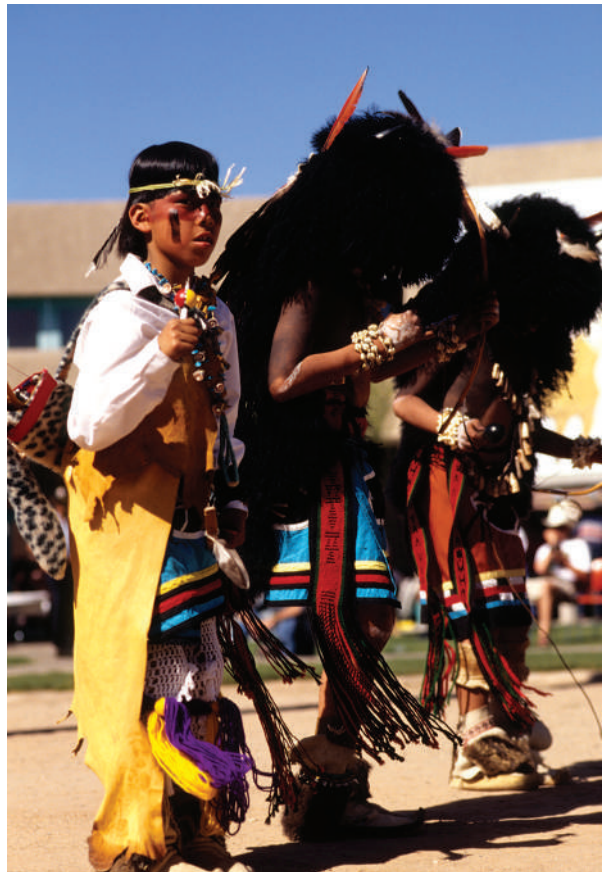
Today, the Pueblo people perform some of the same ceremonies as their ancestors, such as the Buffalo Dance.

The Pueblo economy included trade with other nations. Each nation had specialized trade goods, such as textiles, turquoise minerals, and copper.