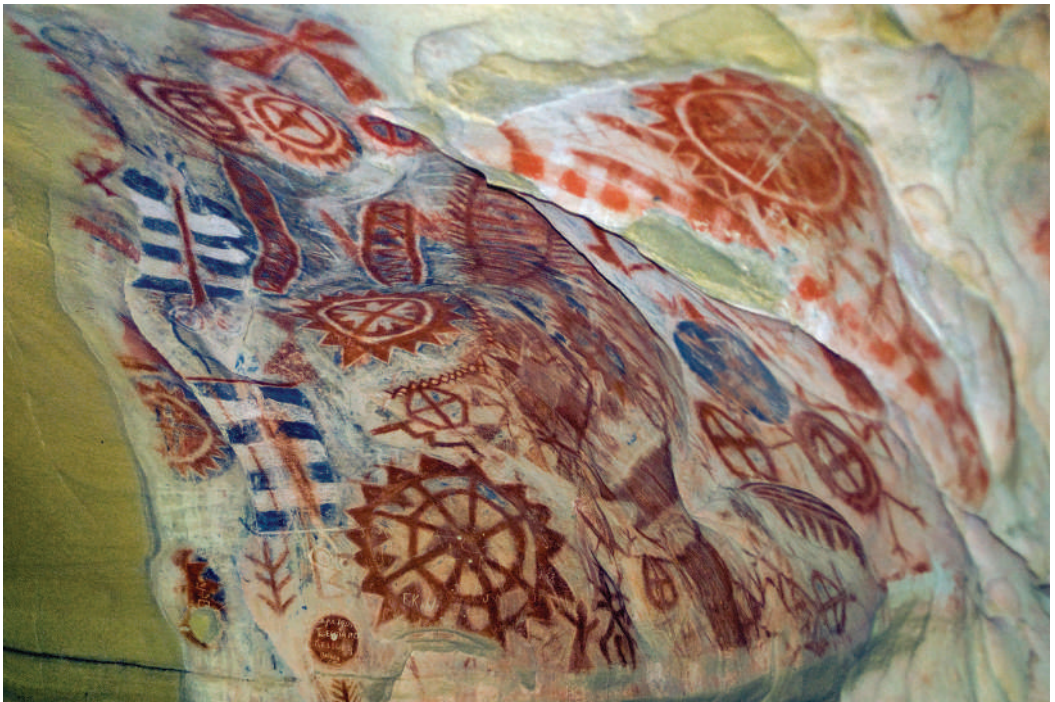
The Chumash people created art on the walls of caves in what is today Southern California.

Change came to the region beginning in 1769 with the arrival of the Spanish, who forced their beliefs and culture on to the people there. They sometimes drove people from their homes. Then, in the mid-1800s, the rush to find gold in the American West forced out even more people. These events caused a lot of the knowledge and culture of these nations to be lost. However, the people of these nations today work hard to recover and preserve their culture and heritage.