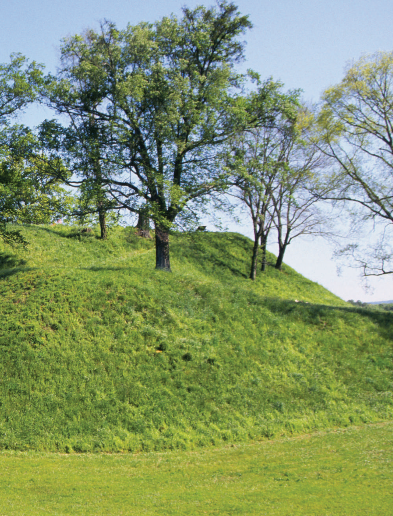
This mound was built by the Mound Builders and still stands today.