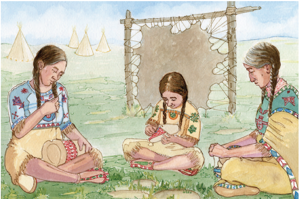
Women played important roles in the lives of Plains peoples.

Girls also learned from the adults around them. Women turned bison hides into fur robes and tepees. They gathered edible plants and, among agricultural tribes, took care of crops. They cooked, sewed, and did beadwork. In nomadic tribes, they were largely responsible for moving camping sites during the hunting season.