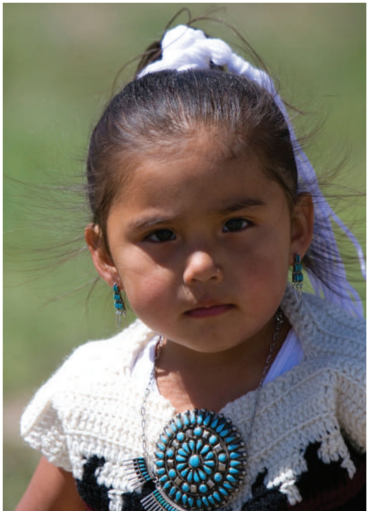
Young Diné girl wearing turquoise and ceremonial dress

The Diné have used turquoise in jewelry making since before European contact. After the Spanish introduced silver in the 1800s, they also learned very fine silversmithing techniques.