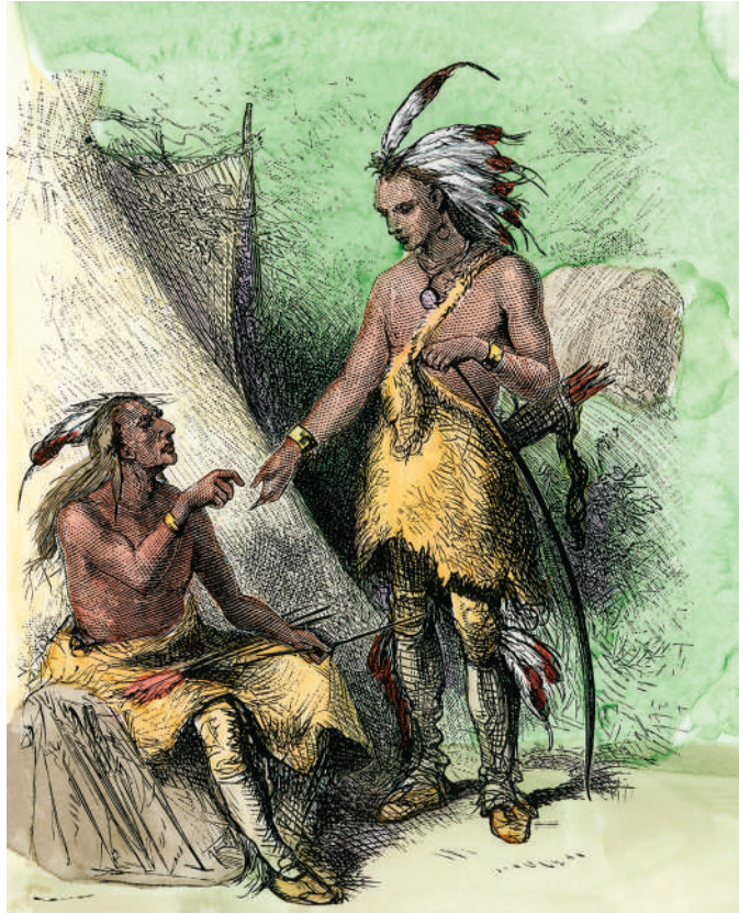
Hiawatha left his home and wandered in the wilderness.

Most Northeast nations celebrated festivals that centered on foods and the harvest. Today, people of the Haudenosaunee nations celebrate a midwinter festival, a strawberry harvest ceremony, and a corn harvest festival.