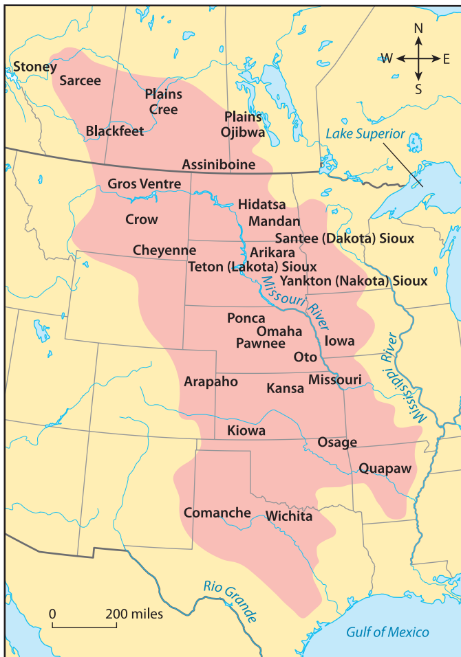
Peoples of the Plains, circa 1850 CE

The Great Plains, in the middle of what is now the United States, were home to many nations.