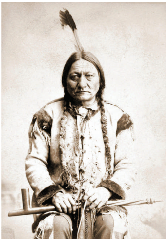
Sitting Bull, a famous Teton (Lakota) Sioux chief, is shown holding a calumet in this photo from 1884.

Hundreds of years ago, boys growing up on the Great Plains listened to stories of how warriors gained glory. Parents and other