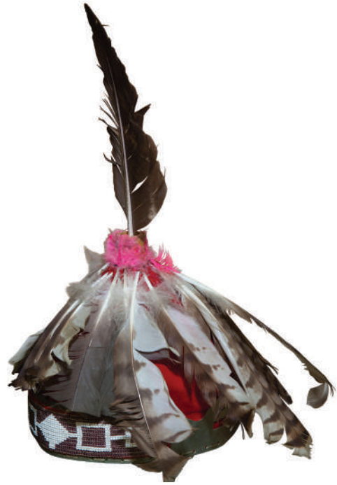
The position of feathers on a gustoweh varied among nations.

Prior to the arrival of Europeans, trade among the nations of the Eastern Woodlands was relatively simple. The land provided so much that each nation's needs were well met. Groups traded with each other for exotic goods that they did not have locally. The most valuable items were shells used to make wampum.