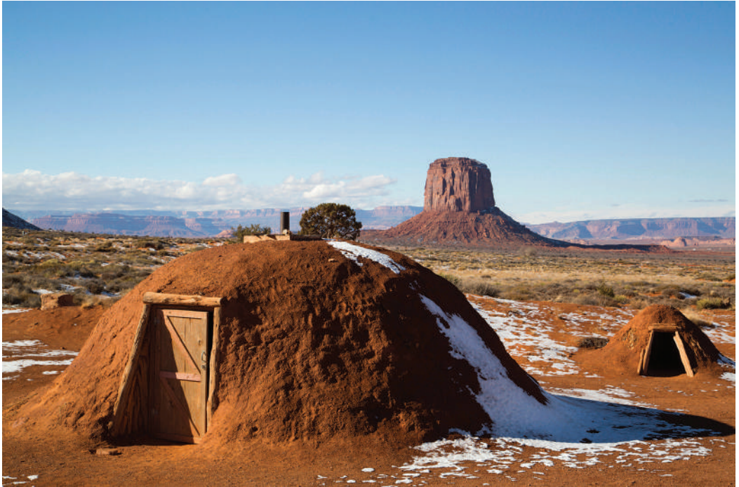
Modern hogons usually have six or eight sides, but traditionally they were round or conical.

The heavy use of mud kept the hogon cool in the hot summer, like the inside of a cave. The door of a hogon faced east to admit the rising sun. Originally, hogons were rounded domes, but over time, they became six- or eight-sided buildings. Hogons are still used by many Diné people today.