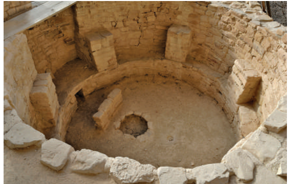
The remains of a kiva ruin show its round shape and the fire pit located near the center.

Families also built underground structures, known as kivas , in which they performed ceremonies as well as day-to-day activities such as cooking and sleeping. Each community also built a grand kiva, where the whole community would gather for ceremonies and rituals. The use of kivas as ceremonial and meeting spaces continued with later peoples as well.