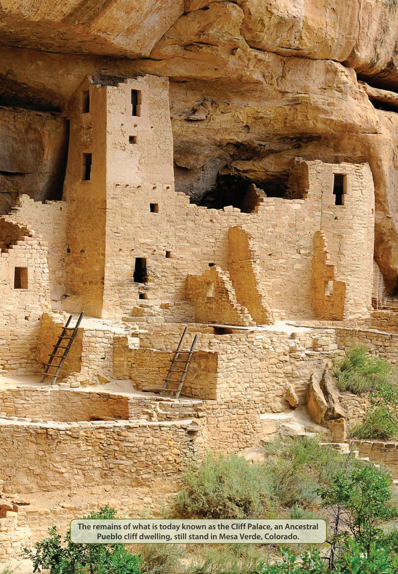
The remains of what is today known as the Cliff Palace, an Ancestral Pueblo cliff dwelling, still stand in Mesa Verde, Colorado.