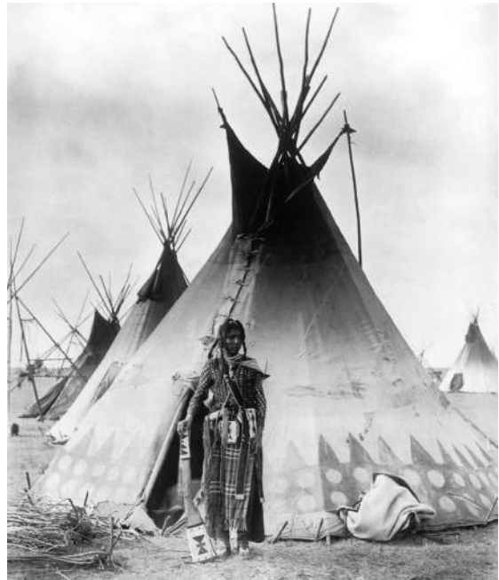
This photo from the late 1800s shows a man at the entrance of a tepee.

However, not all Plains peoples were nomadic all year long. Those who lived in villages