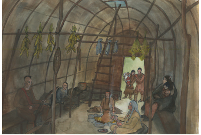
A longhouse served as a home to many families.

All of the societies of the Northeast were structured around clans. Most of these clans were based on the mother's family, but some, such as the Ho-Chunk, used a system based on the father's clan. Clan