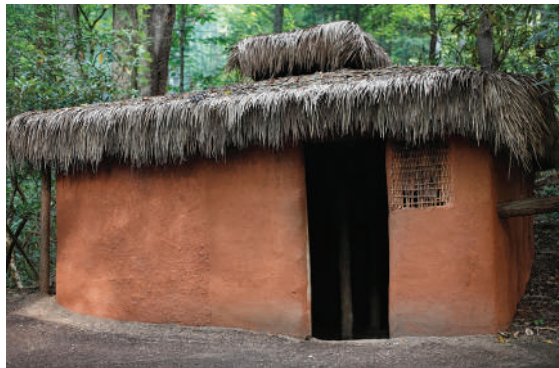
This structure is a replica of the kind of house that some Cherokee people lived in. It has plaster walls and a thatched roof.

Some Southeast nations, such as the Cherokee, played sports. The Cherokee have long played a game called stickball. In this game, teams compete to get a ball through a goal using sticks rather than their hands or feet.