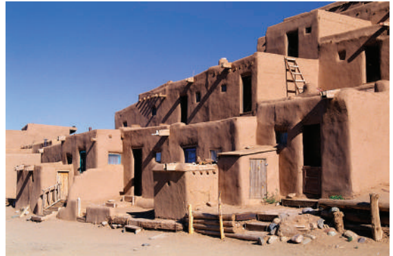
Pueblo construction techniques, like those used to build this part of an old town, are still used in the Southwest today.

The family was very important to the Pueblo peoples. Their large buildings with many rooms could house several generations of a family. Families were organized into clans. Depending on the