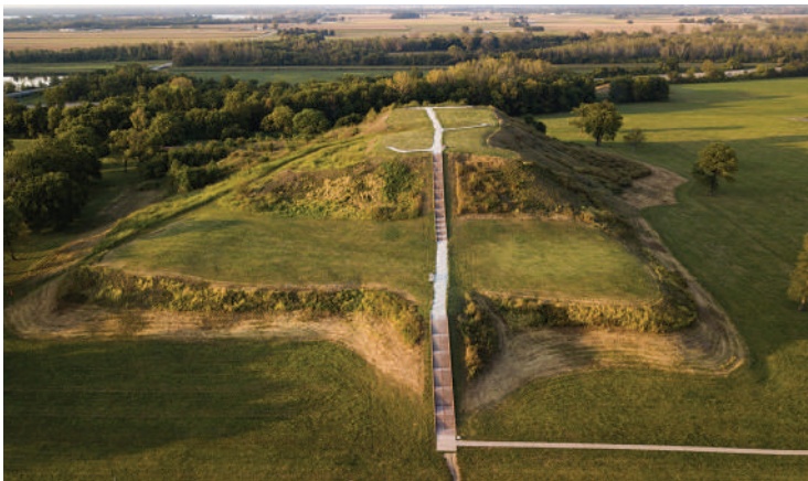
Monk's Mound at Cahokia

During the height of their society, the Mound Builders of the Mississippian culture were farmers. They settled in one place and grew corn, squash, and beans. They also traded with other nations and built cities, roads, and marketplaces.