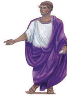
Dictator (in times of war)

The consuls and other patricians were part of the Senate, an assembly of politicians. The members of the Senate did not make laws. They conducted debates and provided guidance on major issues. Patricians could also serve as other types of