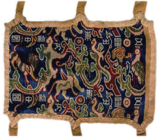
Silk has been made and highly valued in China for more than six thousand years.

As well as horses, the Chinese loved silk. Silk was a precious, valuable fabric. Have you ever felt silk? It is very soft and beautiful. The Chinese got silk by raising special worms, called silkworms. They'd feed the silkworms mulberry leaves. In the springtime, the worms would spin a cocoon made of delicate threads. The Chinese learned how to unwind those threads and weave them into a beautiful fabric. When foreigners saw the fabric, they immediately wanted to trade for it. The silk trade created wealth for China.