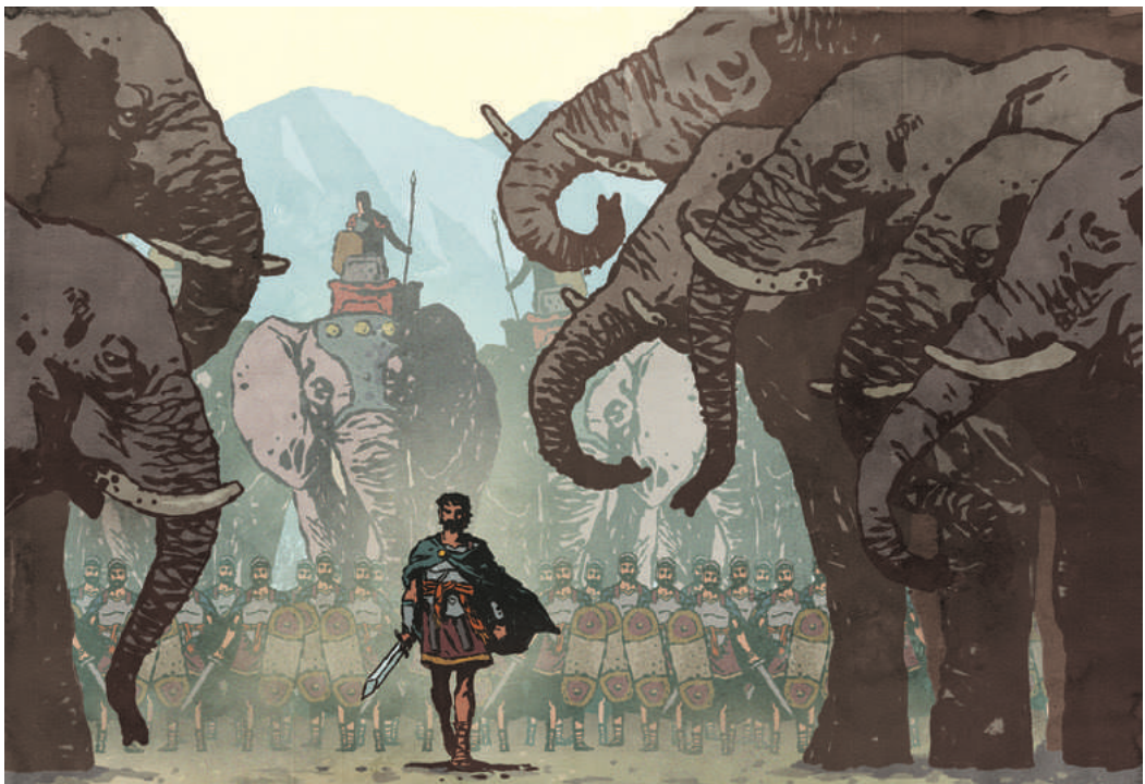
Roman soldiers feared the elephants when they first saw them.

In 221 BCE, Hannibal Barca took control of the Carthaginian army and swore to take vengeance on Rome. He marched his army, including war elephants, through Spain and southern France, across the Alps, and into Italy. The Romans were taken totally by surprise. They were defeated by the Carthaginians in 216 BCE.