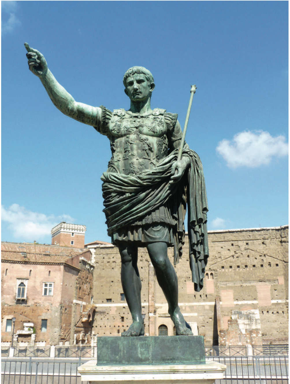
This statue of Augustus Caesar stands in the Roman Forum.