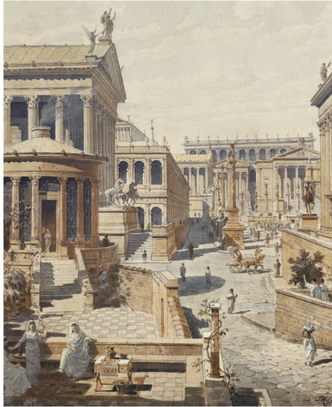
Roman government meetings and religious practices both happened in the Forum.

Public life was central to Roman culture. Romans gathered in amphitheaters, where people watched events like chariot races and battles between gladiators. Both entertainment and politics happened in the Roman Forum. This was a large public space with temples and a place for political bodies to meet. Powerful Romans went to the Forum to be seen. They liked to be admired and cheered by ordinary people. They also liked seeing their enemies