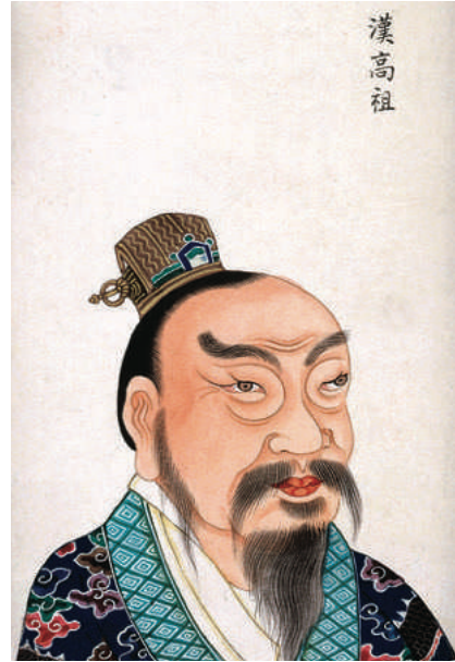
Liu Bang founded the Han dynasty, which ruled for more than four hundred years.

The Han dynasty ruled differently from the Qin dynasty. At first, the Han rulers followed Shi Huangdi's Legalism, but in a gentler way. Eventually, they gave up Legalism and followed the ideas of Confucianism. Confucianism emphasizes the family as the basic unit of society. In Confucius's time, hundreds of years before the Han dynasty, the government was seen as an extension of the family. As the head of society, the ruler was like the head of the family. People owed their rulers loyalty and respect, and rulers had a duty to provide the people with a good government. Confucian thinking suggests that the success of a society depends on people living proper, peaceful lives and obeying their superiors.