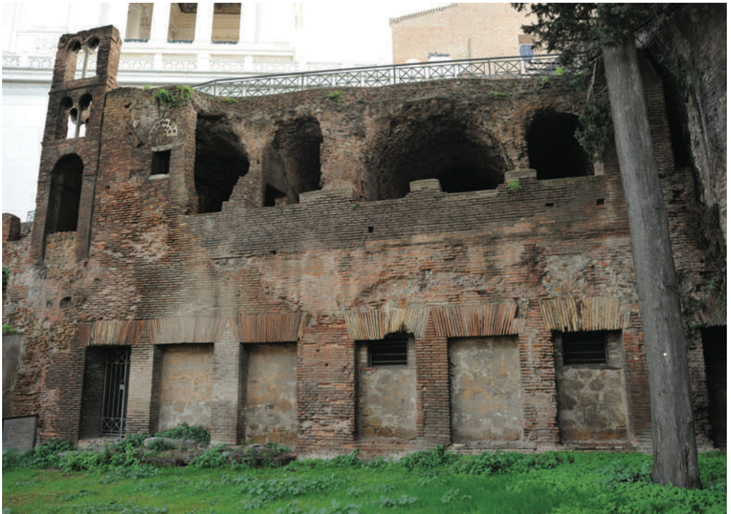
Many Romans lived in insulae .

Enslaved people did all the hard work that supported the comfortable lives of the upper class. This included housework, farming, building, and mining. Some also served as teachers, doctors, and architects. Plebeians worked as farmers, bakers, and craftspeople. They were not paid well, and many were homeless.