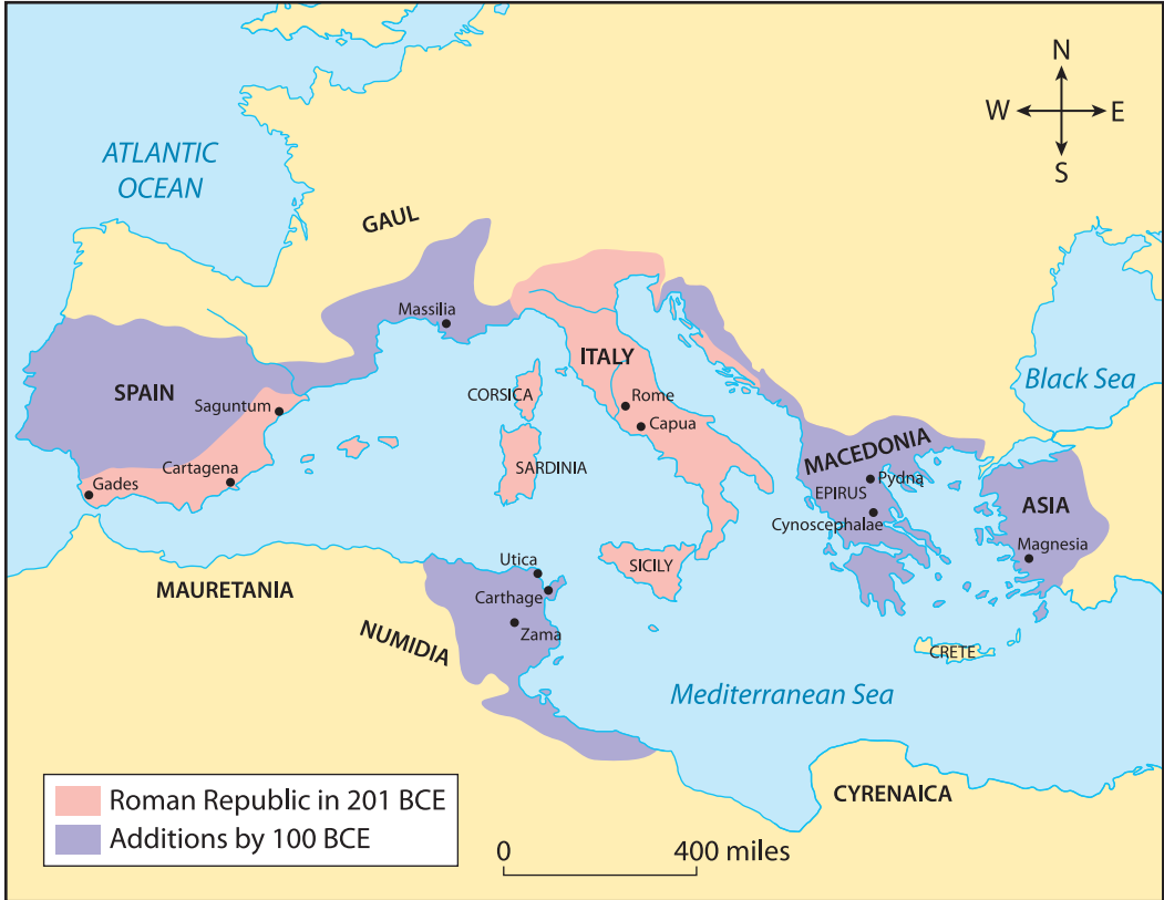
The Roman Republic expanded throughout the Mediterranean region.