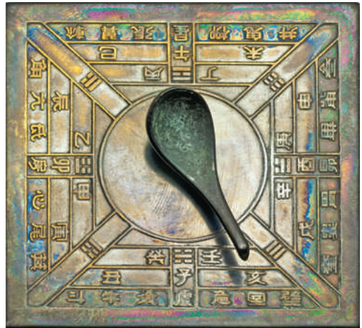
In early versions of the compass, the magnetic stone was shaped like a spoon and moved on the bronze dish below it.

Han dynasty celadon porcelain was so well-made that some of it still exists today and still bears its unique, vibrant colors. Traders from all over Europe and Asia sought the beautiful, durable porcelain made during the Han dynasty.