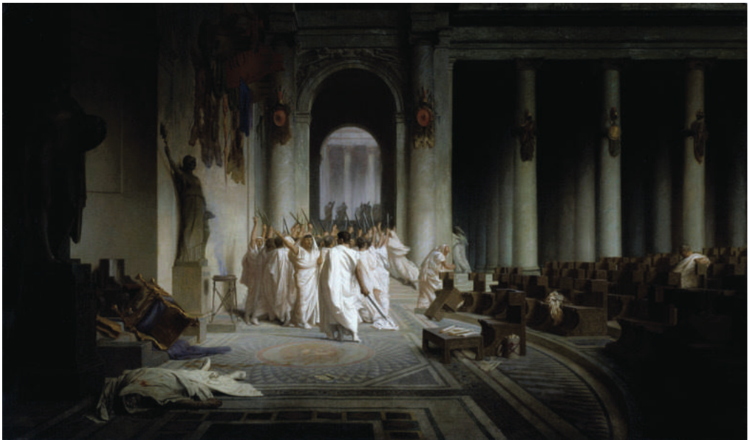
Caesar was attacked and killed on March 15 of 44 BCE. This is known as the Ides of March.

Some people worried that Caesar wanted to become a king and end Rome's proud republican traditions. Their prediction was correct. In 44 BCE, Caesar pushed the Senate to name him dictator for life. This was unheard of in Rome. A dictatorship was supposed to be temporary. Caesar wanted total power forever. His many enemies argued that unless he was stopped, their beloved republic would come to an end. On March 15, known as the Ides of March in the Roman calendar, a group of senators attacked and killed Caesar. The two leaders of the plot, Brutus and Cassius, believed they were saving the republic. They named themselves the new leaders of Rome.