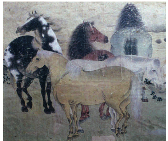
The Akhal-Teke horse, or Heavenly Horse, also known as the “sweats blood horse,” was a prized possession in China. It was one of the first horses to be brought to China from Central Asia.

Zhang Qian’s stories about the western land fascinated the Chinese. People in China listened carefully when they heard about the magnificent horses in Central Asia. In particular, they became interested in a horse known as the “sweats blood horse.” This horse was viewed as special and exotic.