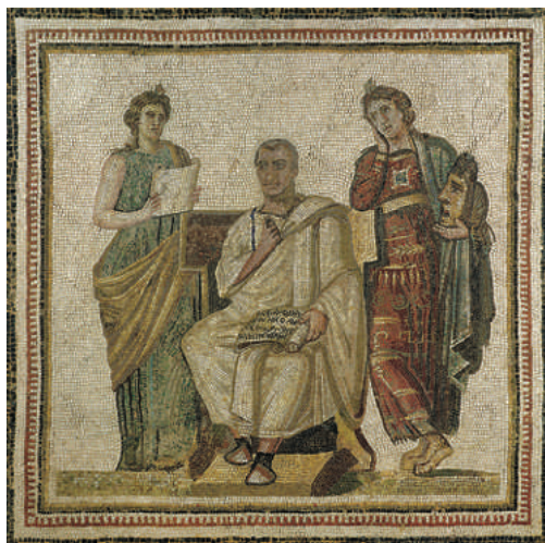
Virgil wrote the epic poem the Aeneid .

Many Romans produced and enjoyed art and literature during Augustus's reign. The poet Virgil wrote a great epic poem, the Aeneid . The Aeneid was inspired by the Greek Iliad and Odyssey . It retells the myth of the beginnings of Rome. It also praises Augustus and his rule. Another poet, Ovid, also wrote texts to build up Rome's grand name. His Metamorphoses tells the history of the world from a Roman perspective. The text