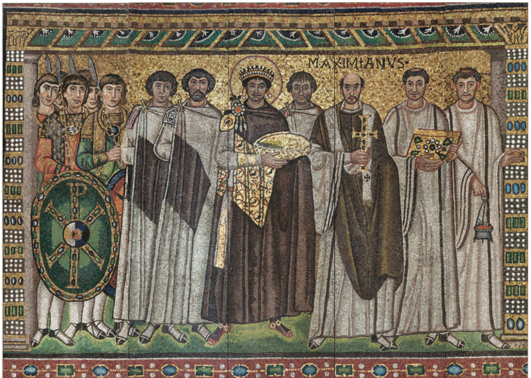
Justinian's court, shown in this mosaic, helped him write the Code of Justinian.

One of the worst outbreaks of plague the world has ever seen happened during Justinian's reign. Plague is a highly contagious, usually fatal disease that affects large numbers of people. Due to the great number of deaths, food production and trade declined, and many people lost their jobs. The plague also left fewer people alive to serve in the army.