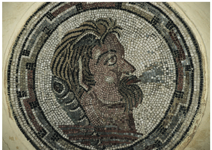
This mosaic on the floor of a Roman house shows Aeolus, the Roman god of wind.

Jupiter was thought to rule every aspect of life. Jupiter's wife and sister, Juno, ruled women. Minerva, the goddess of wisdom, ruled students and craftspeople.