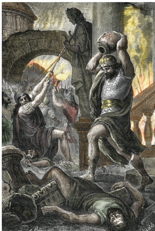
The Gothic leader Alaric I and his men attacked Rome in 410 CE.

Roman Empire fell. The wealthier eastern half of the Roman Empire existed in some form for almost a thousand years after the fall of Western Rome.