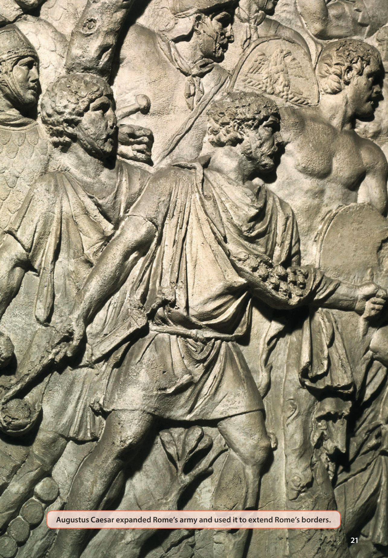
Augustus Caesar expanded Rome's army and used it to extend Rome's borders.