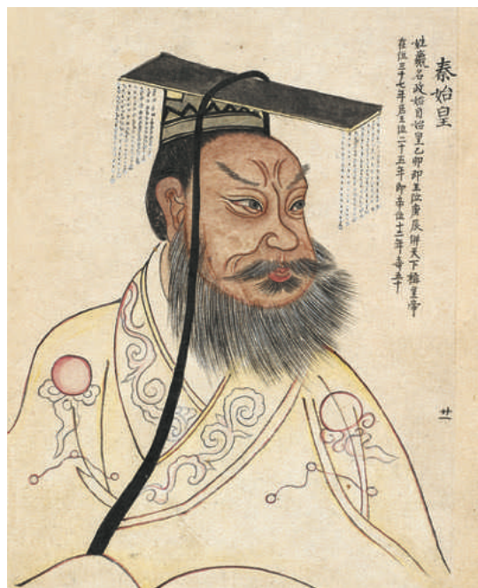
Shi Huangdi ruled China from 221 to 210 BCE.

Zheng claimed the Mandate of Heaven, a belief that the ruler had heaven's blessing and carried out its wishes. In 221 BCE, Zheng declared himself emperor of all of China and took the name Qin Shi Huangdi (/shee/hwong*dee/), meaning First Supreme Emperor. Shi Huangdi established the Qin dynasty, named after his home state.