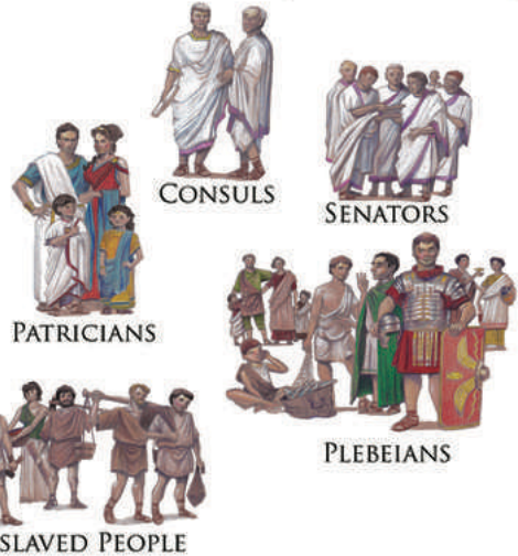
Roman society was divided into different groups, with different roles and powers.