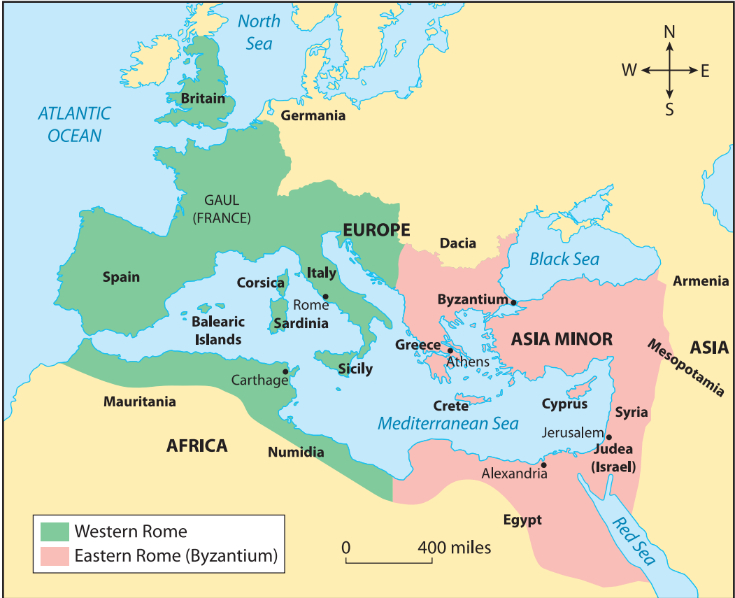
Splitting the Roman Empire in two was meant to make it easier to rule such a huge territory.