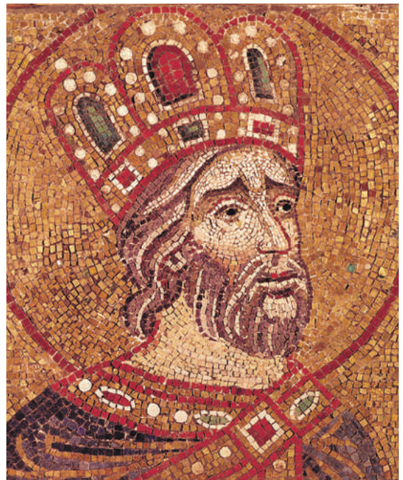
Constantine became the first Christian Roman emperor.

persecute , v. to treat a group of people unfairly and cruelly