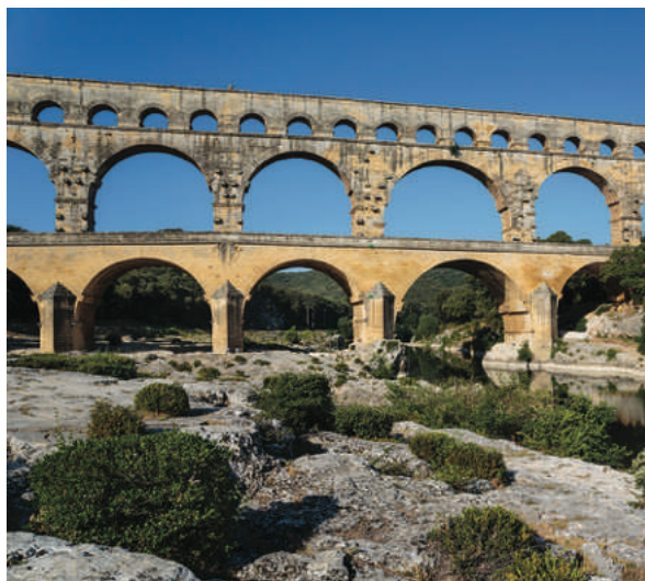
Aqueducts, like this one in modern France, brought clean water to distant parts of the Roman Empire. The arches made the structure very strong.

Romans used the arch shape in their construction of large and strong aqueducts and bridges. Arches spread the weight of the structure onto supporting columns. These large, sturdy bridges allowed Romans to move troops, military equipment, construction materials, and other goods quickly and easily across their huge empire. Strong roads and bridges meant the empire could continue expanding.