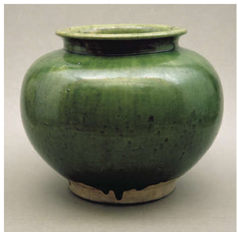
Celadon glaze can be green, blue, or any hue in between.

celadon , n. a pottery glaze that varies from green to blue