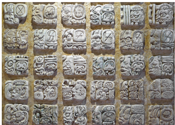
Mayan writing was often carved into stone.

The Maya were also skilled at mathematics. They developed a system of number symbols.