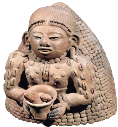
The cacao beans on this pottery indicate the importance of cacao to the Maya.

Archaeologists believe that Maya civilization reached its greatest extent between about 200 and 900 CE. At its peak, as many as two million Maya people lived in city-states. They built more than forty of these city-states using stone and earth. Each had a population between five thousand and fifty thousand inhabitants.