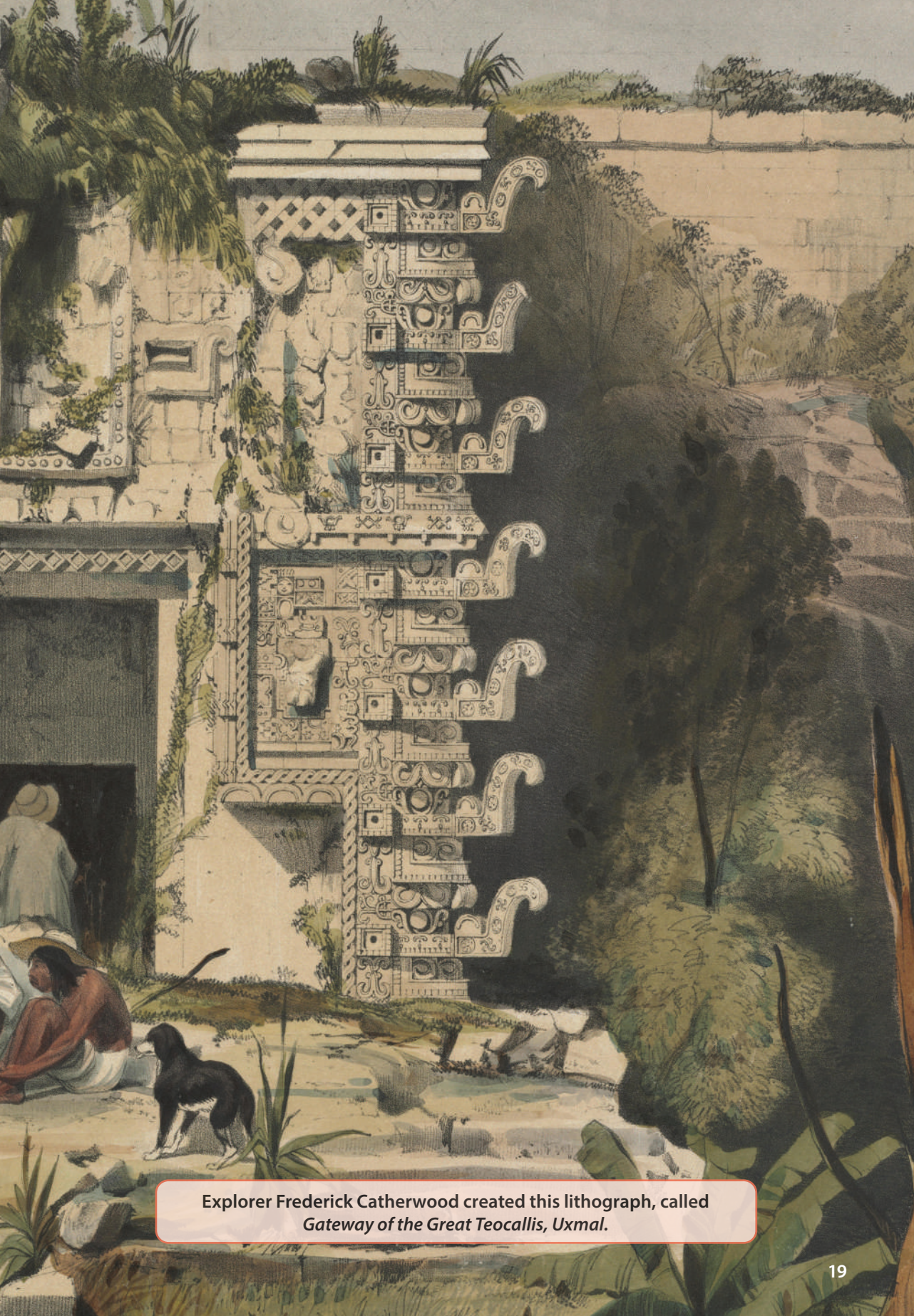
Explorer Frederick Catherwood created this lithograph, called Gateway of the Great Teocallis, Uxmal .