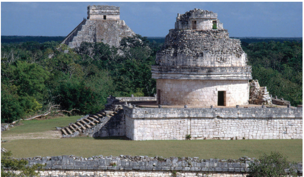
The Maya observed the sun, moon, planets, and stars from El Caracol, an observatory in Chichén Itzá.

Because the Maya had two calendars, each day had two names. One name came from the Sacred Round and the other from the solar calendar. This also meant that all Maya people had two birthdays.