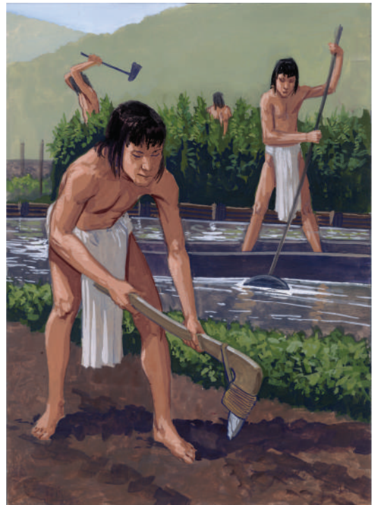
Maya farmers raised food for the people of their large cities. In the lowland areas, farmers created waterways to redirect and save water.

As the Maya developed more productive farming techniques, they were able to easily feed