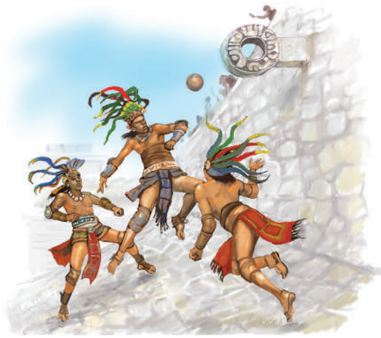
Nearly every Maya city had at least one ball court.

Imagine big, strong pok-ta-pok players stepping out onto the court. They wear leather helmets and pads to protect themselves. You can also see that they are worried. They know that the stakes are high. Pok-ta-pok is a game with religious meaning. The Maya think