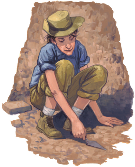
Archaeologists still study the remarkable Maya civilization.

in research have revealed much about the Maya civilization, language, and culture. Let's take a closer look at what we know about them and what still remains a mystery.