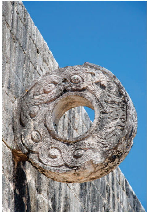
This photo shows a ring at the Great Ball Court in Chichén Itzá.

When the game begins, the sound of the bouncing ball is added to the cheers. Pok, pok, pok! goes the hard rubber ball as it hits the ground and bounces off the walls of the court.