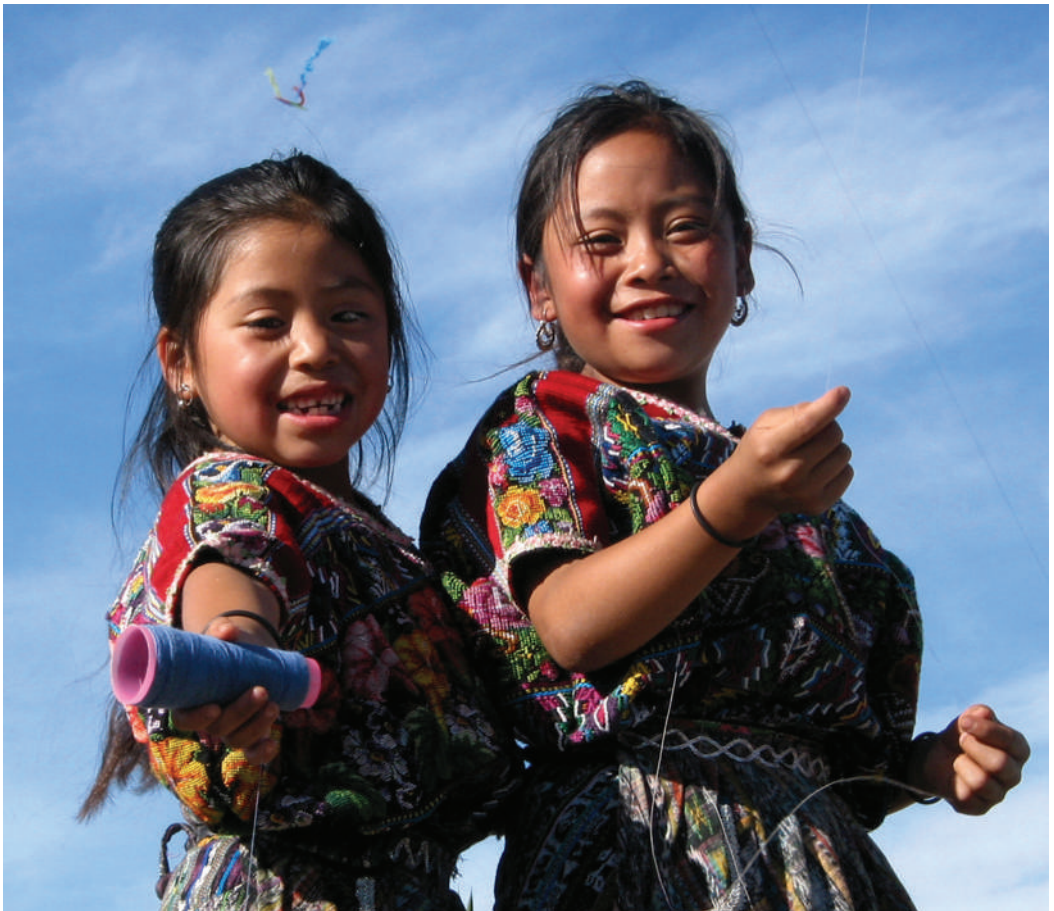
At least six million Maya people still live in Central America today.

We know that many centuries ago, the Maya left their cities behind. But the people themselves did not disappear. They relocated to new settlements, often closer to the coast. Today, millions still speak languages related to ancient Mayan. These descendants of the pyramid builders have lived in villages, towns, and cities in southern Mexico, Guatemala, and Honduras for centuries. Some carry on the traditions and lifestyle of their ancestors, while others live a modern lifestyle. Many Maya blend traditional and modern ways of life.