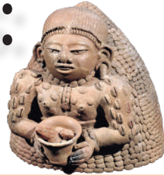
Pottery with cacao beans