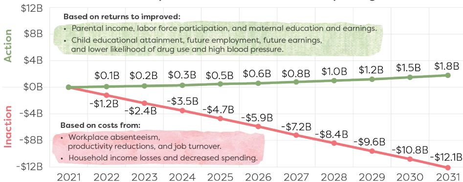
Louisiana 10-Year Economic Impact Forecast from Early Childhood Care and Education Spending