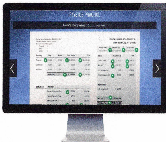
Exploring The Components Of A Paystub

Can You Afford To Buy A Car? - That brand new sports car may be calling your name, but there are a lot of things to consider before buying your first car. Students pick a car to buy, and see whether it will push their budget to the limit.