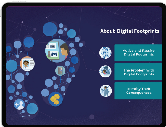
Lesson 2: Safety and Privacy

NOTES (differentiation, student groupings, additional questions, etc.)