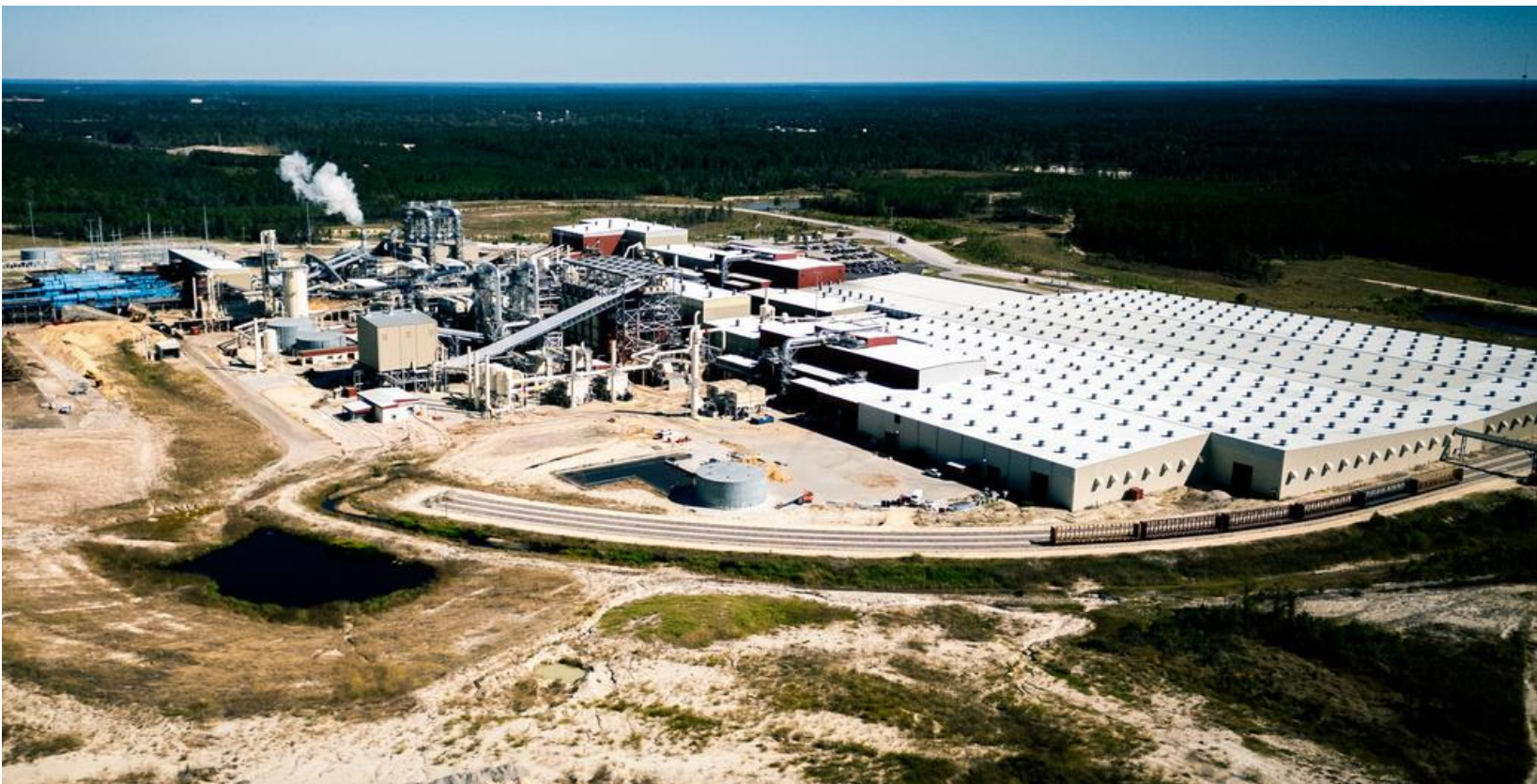
CORRIGAN OSB, LLC | CORRIGAN, TX