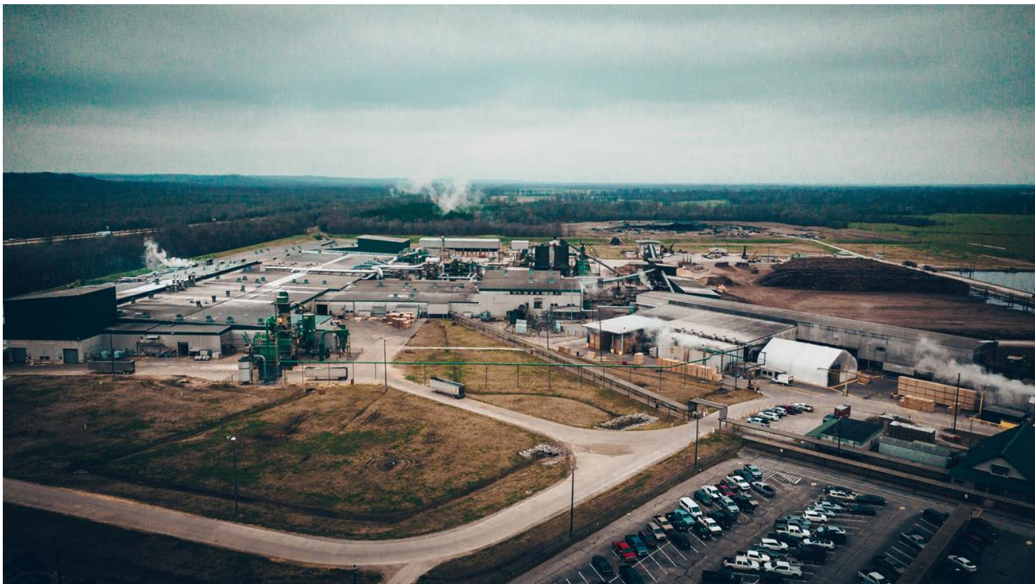
ROYOMARTIN-PLYWOOD & TIMBER MILL | CHOPIN, LA