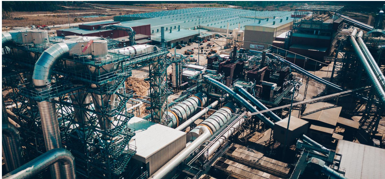
ROYOMARTIN-OSB | OAKDALE, LA