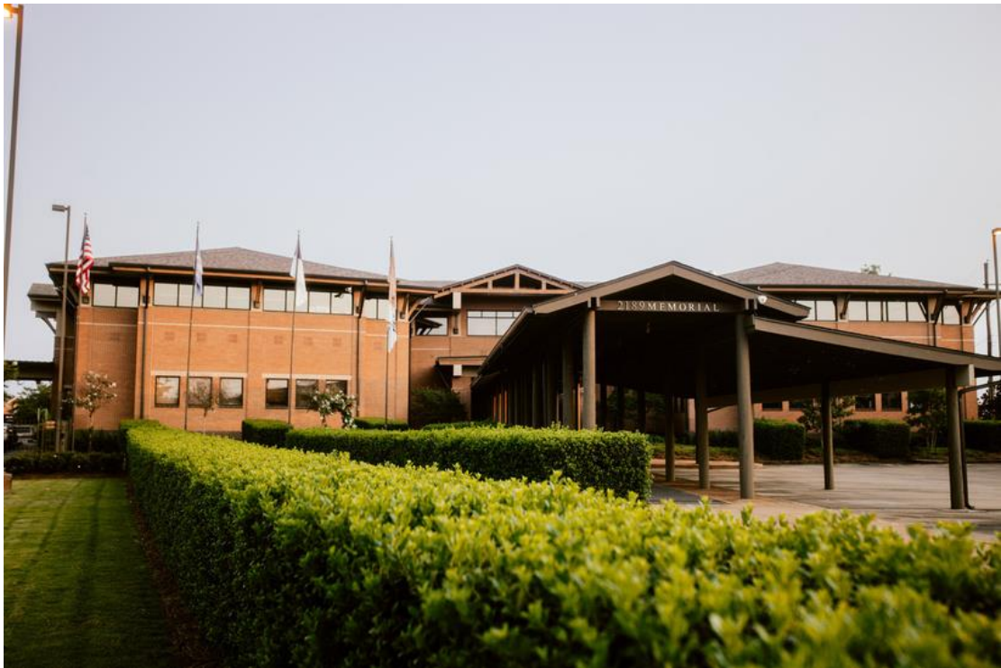
CORPORATE OFFICE | ALEXANDRIA, LA