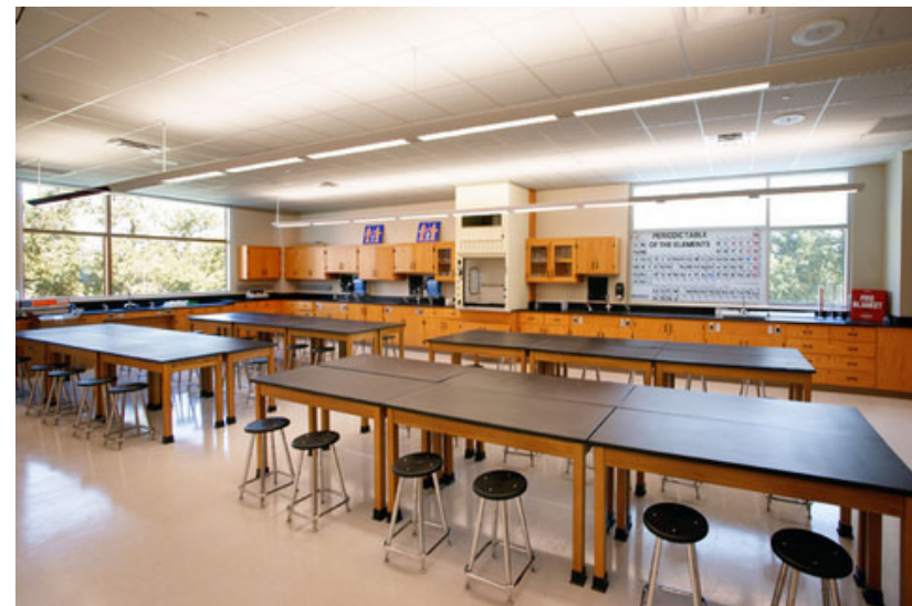
Lake Area School, Opened January 2010

Some facilities will continue to be used throughout the duration of the building process.