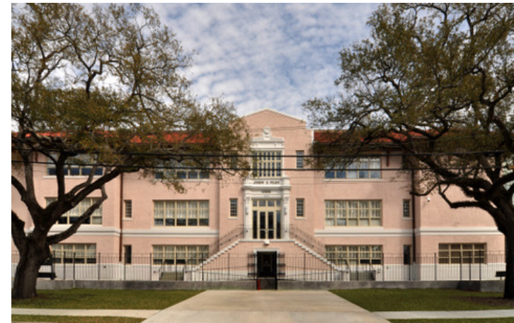
Andrew Wilson School, Opened January 2010

Phase 1 is underway, with seven schools completed, ten schools currently under construction, and nine schools in the design or procurement stage.