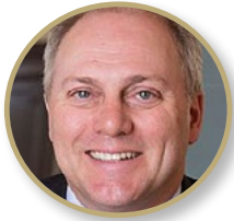
Steve Scalise District 1 59.8%