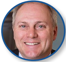
Steve Scalise District 1 60.1%