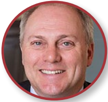
Steve Scalise District 1 59.3%