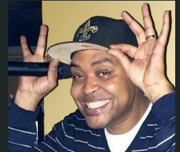
DJ Slab 1 - Q 93 Radio