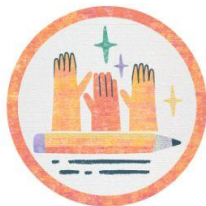
INSTRUCTIONAL LEADERSHIP TEAM