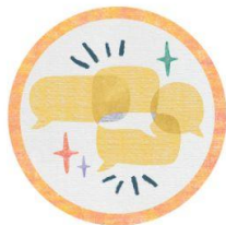
TEACHER COLLABORATION SUPPORT