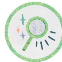
CAREER PIPELINE SUPPORT