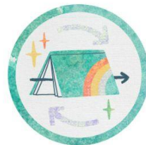
PRINCIPAL STANDARDS SUPPORT