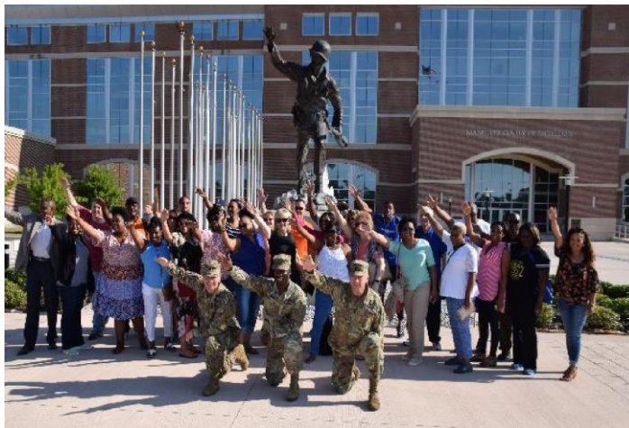
Baton Rouge Recruiting Battalion

Transportation Provided & Hotel Accommodations Reimbursed!