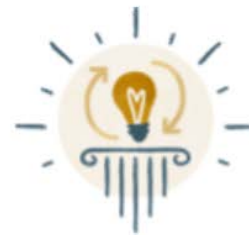
ONGOING PROFESSIONAL GROWTH