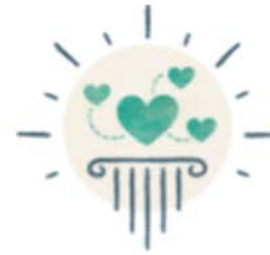
FAMILY LITERACY ENGAGEMENT