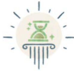
EXPLICIT INSTRUCTION, INTERVENTIONS, AND EXTENSIONS